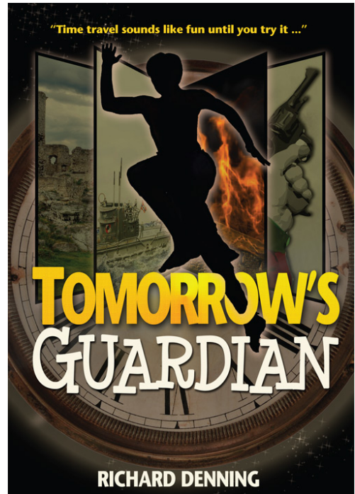
Above: 2011 Paperback Cover

Soon, Tom's family are obliterated from existence and Tom must make a choice between saving them and saving his entire world.